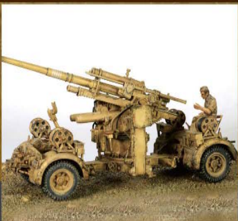
Models can be displayed as battle or transportation formation.