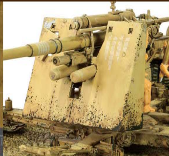
Probably the most authentic weathering effect seen in mass production hobby models.