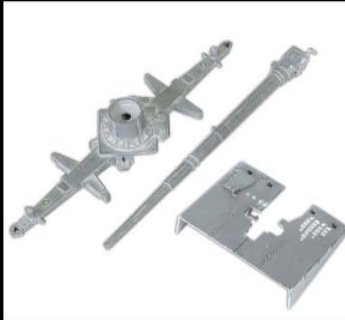
Diecast metal materials used in cruciform, gun shield and barrel.