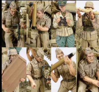
North Afrika Korps editions with 8 highly detailed 1/32 scale figures.