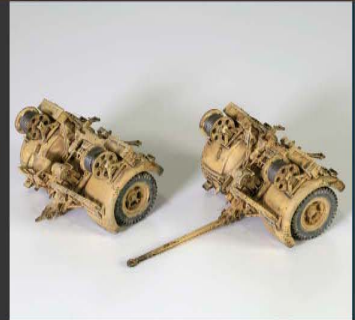
Comes standard with Sd.Ah.202 Bogies with rotatable wheels.