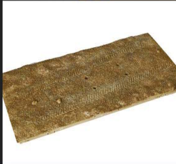
All new Forces of Valor 1/32 scale tanks series now features realistic sectioned-landscape display.