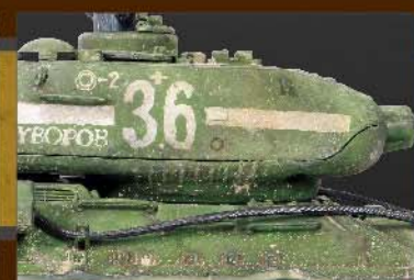
• Highly detailed pad prints