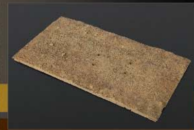
• Realistic landscape display