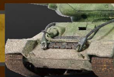
• Authentic weathering effect