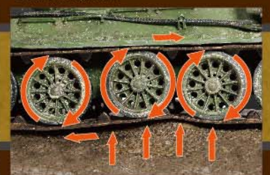
• Moveable suspensions and spinning wheels