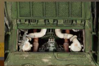
• Engine compartment details