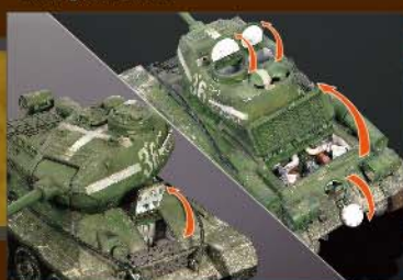
• Open hatches