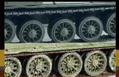
• New tooled hull bottom, road wheels and caterpillars