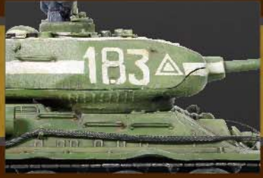
• Highly detailed pad prints