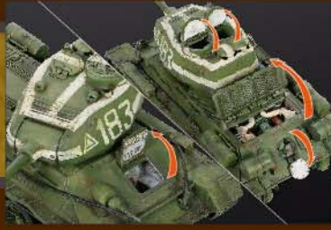
• Open hatches