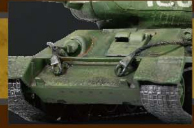
• Authentic weathering effect