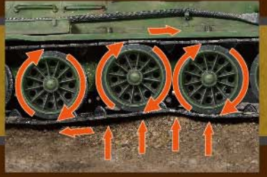
• Moveable suspensions and spinning wheels