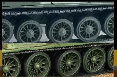
• New tooled hull bottom, road wheels and caterpillars