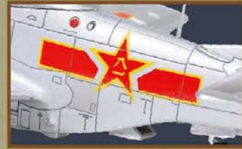
Highly detailed pad print.