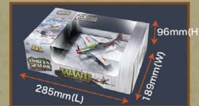
Exquisite and standard size FOV aircraft series packaging.