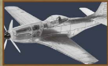
95% diecast body structure.