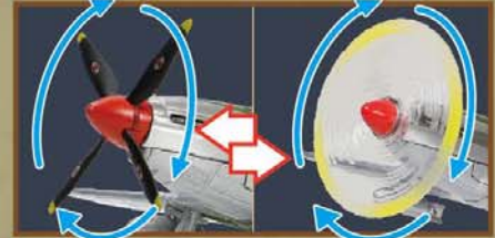
Interchangeable propeller designs for spinning/static modes.