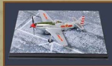
Full coloured ground parking display base.