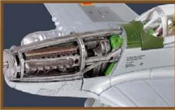
Intricately detailed engine.