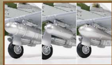
Decorative removable drop tanks.