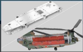
• Partial Diecast metal body structure and full interior details (Including the cockpit, pilot and cabin)