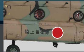
• Research base on real helicopter