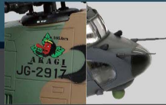
• Intricate surface details and FOV signature weathering effects