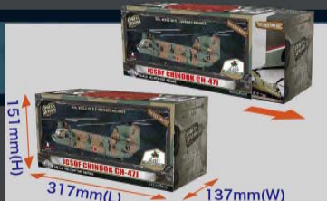
• Exquisite and standard size FOV helicopter series packaging