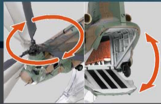
• Movable spinning blades and rear access ramp