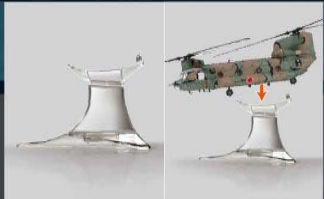
• Sturdy display stand