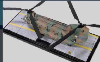
• Display base graphic base on real helipad tarmac