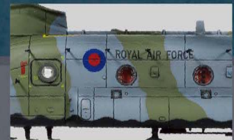
• Authentic camouflage pattern according real Bravo November ZA718