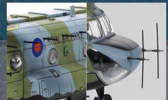
• Meticulous surface details