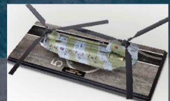
• Helipad pattern base on HMS Hermes (R12), where Bravo November ZA718 landed during Falklands campaign