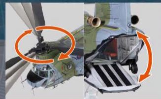
• Movable spinning blades and rear access ramp