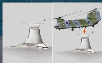
• Sturdy display stand