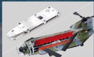
• Partial Diecast metal body structure and full interior details