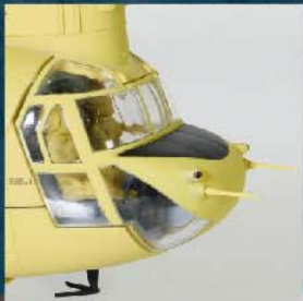
Completely re-tooled front canopy with easy insert antennas