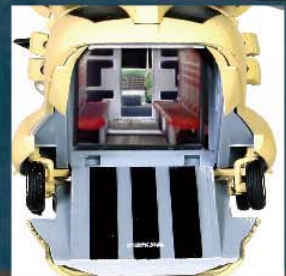
Full interior details