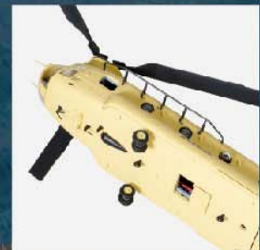
Die-cast metal lower body