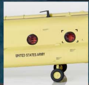
Over 20 pad printing markings across helicopter body surface