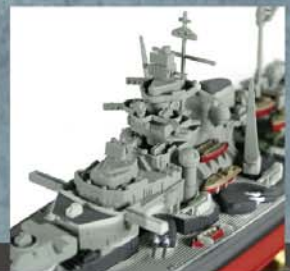
Created from painstaking research and historical notes.

Tirpitz entered service in 1941 as the largest German ship to ever be produced. After completing sea trials Tirpitz was sent to Norway in order to hold the soviet fleet at bay and protect against allied invasion. It also had the bonus effect of forcing the Royal naval to position extra ships in the North Sea so the Tirpitz could not gain access to the Atlantic Ocean. Tirpitz's notoriety however did paint it with a target, the allies committed large resources to sinking her. Eventually in November 1944 the Tirpitz was located. 32 Lancaster bombers were sent equipped with 12,000 pound bombs, 2 direct hits and a third bomb exploding just to the side caused the Tirpitz to capsize.