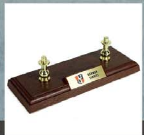
Wooden look display stand with chrome plated metal pillars.