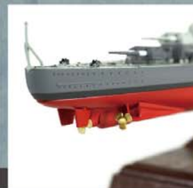
Die cast metal hull