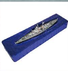
Warships can be displayed in battle mode nestled in their own sea wave blisters.