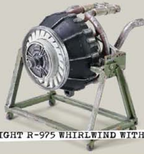
WRIGHT R-975 WHIRLWIND WITH STAND!