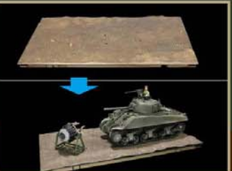
Realistic landscape display.