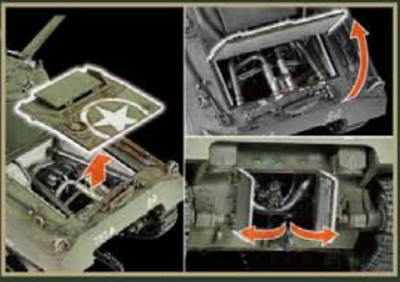
Removable engine cover panel and movable rear hatches.