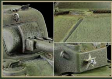
Authentic casting textures across all tank surface.