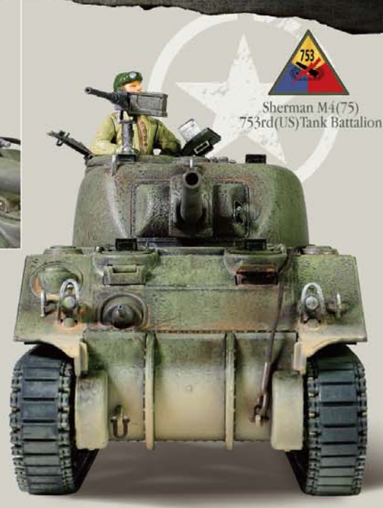
Sherman M4(75) 753rd(US) Tank Battalion