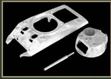
Die cast metal turret, upper hull, and CNC machined aluminium gun barrel.