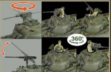
Movable M2 Browning turret machine gun & rotatable cupola.