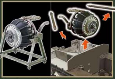
Precise replica Wright R-975 Whirlwind engine with stand.