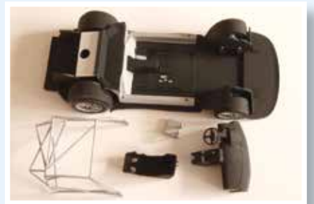
Photo 6 With the chassis assembled and painted, the cage is made up of four parts and once painted is ready to be fixed into position along with the seat, foot pedals and steering column.