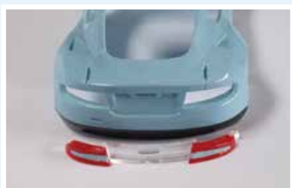
Photo 10 The rear lights are also painted before fitting them to the inside of the car.