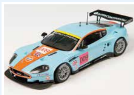
Photos 11 & 12 Once construction is complete and the decals applied the model looks superb.