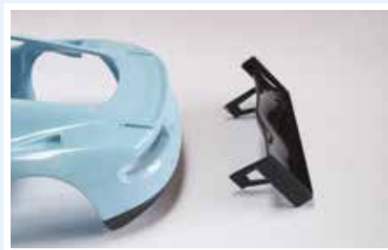
Photo 8 The Spoiler is assembled and painted gloss black before fitting to the rear of the car.