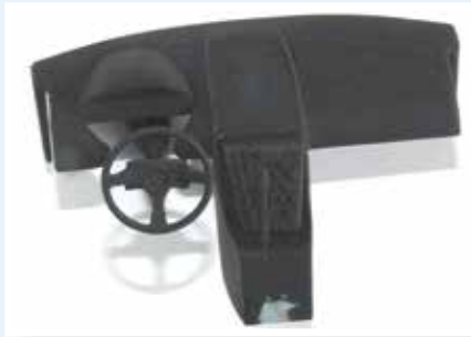
Photo 5 No less than five parts make up the dashboard and steering wheel, a gear stick is also included.