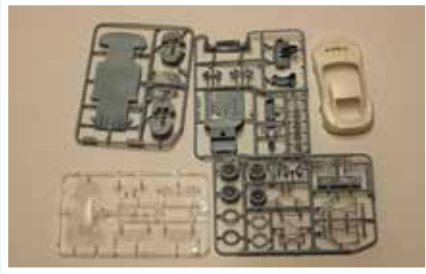
Photo 1 Three grey sprues carry forty seven parts and seven parts are carried on one clear sprue while the main body of the car is white and moulded as a separate item.