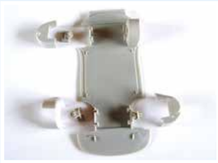
Photo 4 The four axles are fixed into grooves on the chassis and the mudguards fixed over them.