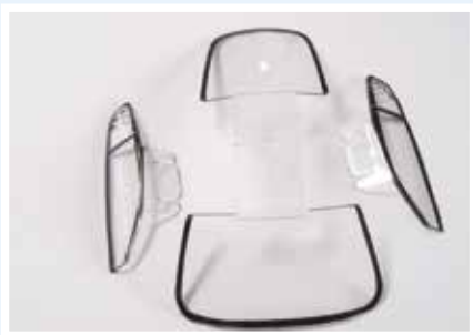
Photo 7 The transparencies are given a gloss black edging and allowed to dry before fitting into the main body.