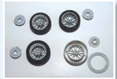
Photo 3 Each of the tyres has a ring which forms the inner sidewall of the tyre when cemented in place. The disc breaks ad as locating lugs when fitting the wheels to the axles.