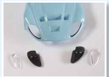
Photo 9 Head lamp units are painted before being fitted to these positions inside the body and the clear lenses fixed over them.