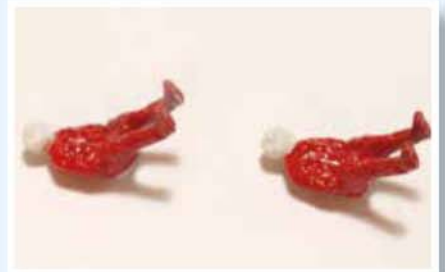
Photo 6 Two pilot figures are included.