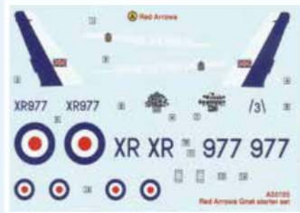
Photo 2 The small decal sheet carries markings for Red Arrow XR977 based at Royal Air Force Kemble Gloucestershire England during 1978/79.