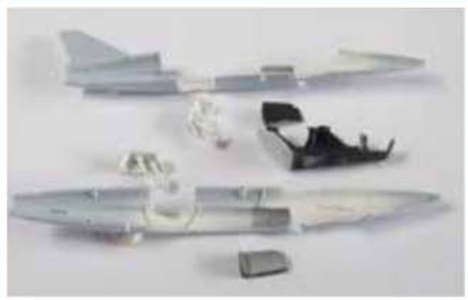
Photo 4 With the cockpit section complete, the undercarriage legs and bays are assembled along with the intake inner walls, before cementing the fuselage halves together.