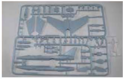
Photo 1 Spread over two sprues, are forty seven grey parts while two clear parts are carried on a separate sprue. Some of the parts are not used for this model.