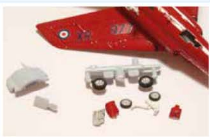
Photo 7 The undercarriage wheels and nose leg along with some small aeriels can be assembled to finish the model. Provision is made for the undercarriage to be omitted and the model posed in the flying configuration, these are the small unpainted parts on the left of the picture.