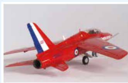
Photo 8 This is a lovely little model and a pleasure to build. Now all that is needed is another eight to form the rest of the team.