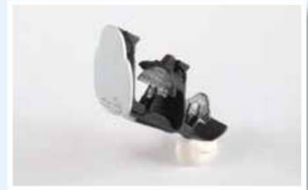
Photo 3 The first six stages of construction build up the cockpit detail, consisting of floor, bulkheads, seats, control columns and instrument panels for which decals are provided for the instruments.