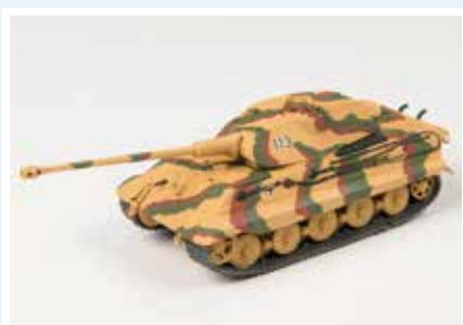
Photos 10, 11 & 12 With the camouflage pattern hand painted and the decals applied the king Tiger looks ready for battle.