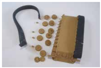
Photo 4 Once the hull is assembled and painted, the 46 wheels and two tracks can be fitted.