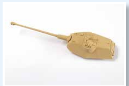
Photo 9 The completed turret ready to be fitted into position.