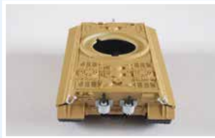
Photo 5 With the tank body cemented to the hull, exhausts and towing eyes are fitted to the rear of the tank.