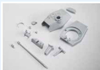
Photo 8 Thirteen parts make up the turret assembly, with careful gluing the gun barrel is free to raise and lower.