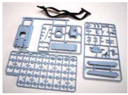
Photo 1 Eighty nine crisply moulded parts are carried on three sprues, while the two tracks are moulded in rubber.