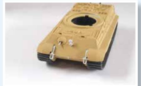
Photo 6 While a machine gun, search light and more towing eyes are added to the front.